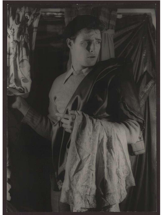
Marlon Brando as Stanley in the 1951 film adaptation

Stanley Kowalski is a representation of New America - an America that was born after World War. Stanley, having fought in the Second World War, as “ a Master Sergeant in the Engineers' Corps ”, is now a part of the working class in New Orleans. He represents the American Dream of freedom and opportunity for all. An ideal that transcends the boundaries of social classes. Characterized as a domineering male, Stanley loves gambling, drinking and sex. We know he passionately loves his wife and friends—but harbours hatred towards Blanche. Stanley is aware that his wife is of aristocratic descent, but as she is accepting of his dominance in their marriage, he seems unaffected by his class that is until Blanche, the epitome of everything he isn't, finds her way into their household. Williams depicts Stanley as a misogynistic, hypermasculine specimen who believes in male superiority .